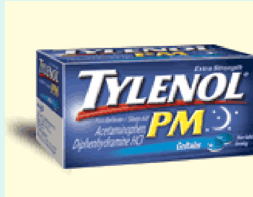
Tylenol PM or generic