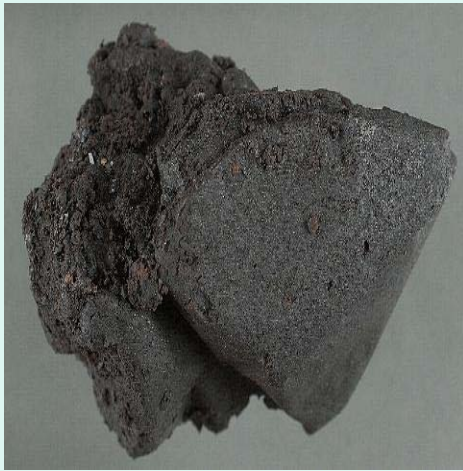
Black Tar Heroin