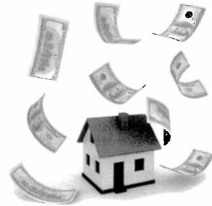
A QUICK REFERENCE GUIDE

NOW THROUGH APRIL 30, 2010 Qualified FIRST-TIME HOME BUYERS can receive a credit of up to $8,000 . Other qualified buyers can receive a credit of up to $6,500 for homes purchased between November 7, 2009 and April 30, 2010. DON'T MISS THIS OPPORTUNITY!